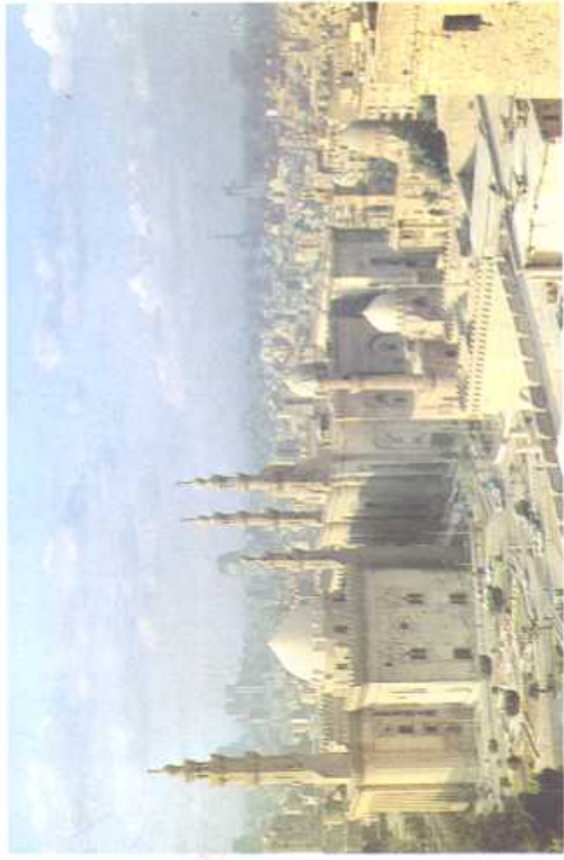
The Refay and Sultan Hassan Mosques / Cairo